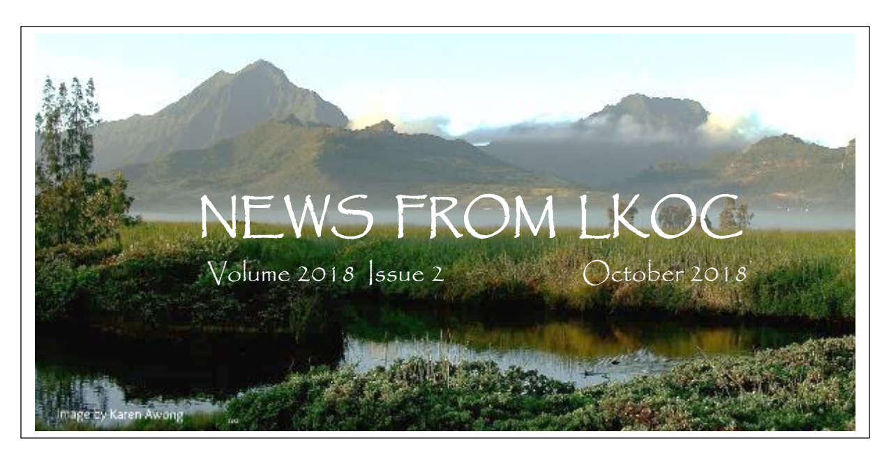
Aloha LKOC Members and Supporters,

This year marks our 70 <sup>th</sup> Anniversary as a branch of The Outdoor Circle! It has been seven decades since our first meeting in May 1948, and Kailua has seen a lot of change over those years. But one thing that has never changed, in all that time, is LKOC's (Lani-Kailua Outdoor Circle) dedication to its mission of "Keeping Kailua Clean, Green and Beautiful".