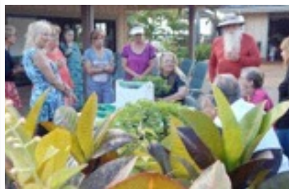
Learning how to repot a Bonsai!