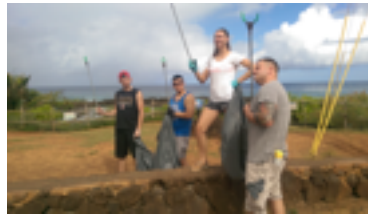
Bike Path Cleanup