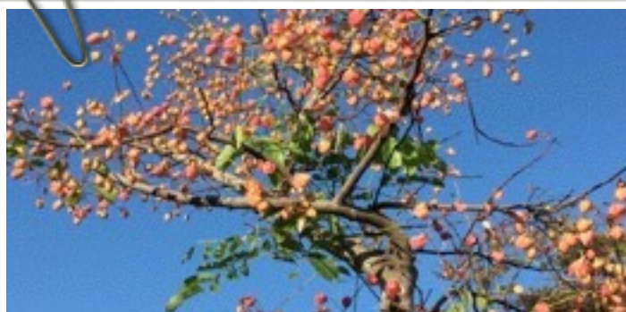
A tree grows next to Banzai Skate Park