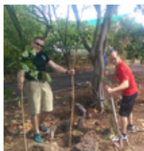
Bike Path Cleanup