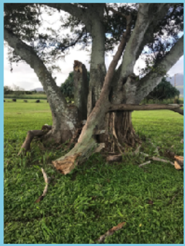
CHINESE BANYAN TREE GALL WASP INFESTATION