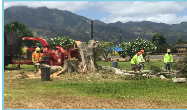
TREE REMOVAL NSOC AND STATE MAINTENANCE DEPARTMENT