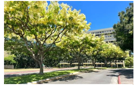
Queen’s White Shower Trees East West Drive

In the mid to late 1990s, The Outdoor Circle would host a yearly “Shower Tree Festival” to celebrate these beautiful trees that are in full bloom in mid-summer. On June 28, in commemoration of those events, and in partnership with The Friends of Honolulu’s Botanical Gardens, TOC co-hosted a guided tour of the hundreds of shower trees on the UH Manoa campus, which run the lengths of the central medians of both East West Drive and Maile Way, and elsewhere on campus