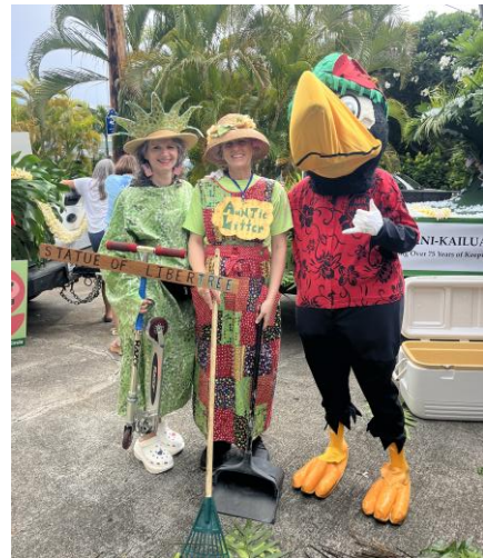
Statue of Liber-Tree, Anti-Litter, and Mr. Mynah