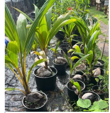
Our “Niu Sanctuary” Keiki

If you are interested in donating niu, please contact us at lani-kailua@outdoorcircle.org . We will provide pickup/transfer to the sanctuary.