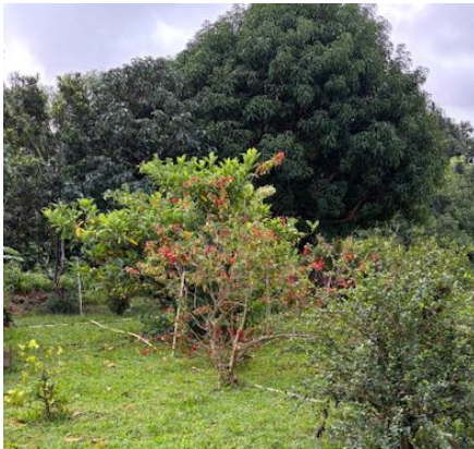
Newly Refurbished Lei Garden

We are happy to announce that a newly refurbished lei garden will soon be operational within our “Learning to Grow” (LTG) program at the Women’s Community Correctional Center (WCCC).