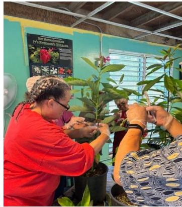
Learning Plant Propagation

The lei garden, next to the LTG Nursery, was originally established by the Garden Club of Honolulu (GCH) several decades ago. However, in recent years, GCH left the area in LKOC’s care. Since then, while it had been kept free of overgrowth, it had not been operational.