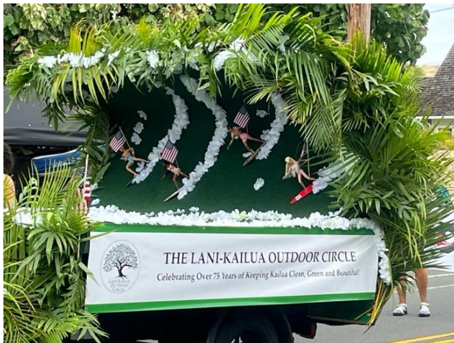
LKOC’s “Green Wave of Aloha” 4 th of July parade float

To view a slideshow video of the event, visit our Activities and Events webpage at: www.lkoc.org/Activities-and-Events.html#Fourth2025