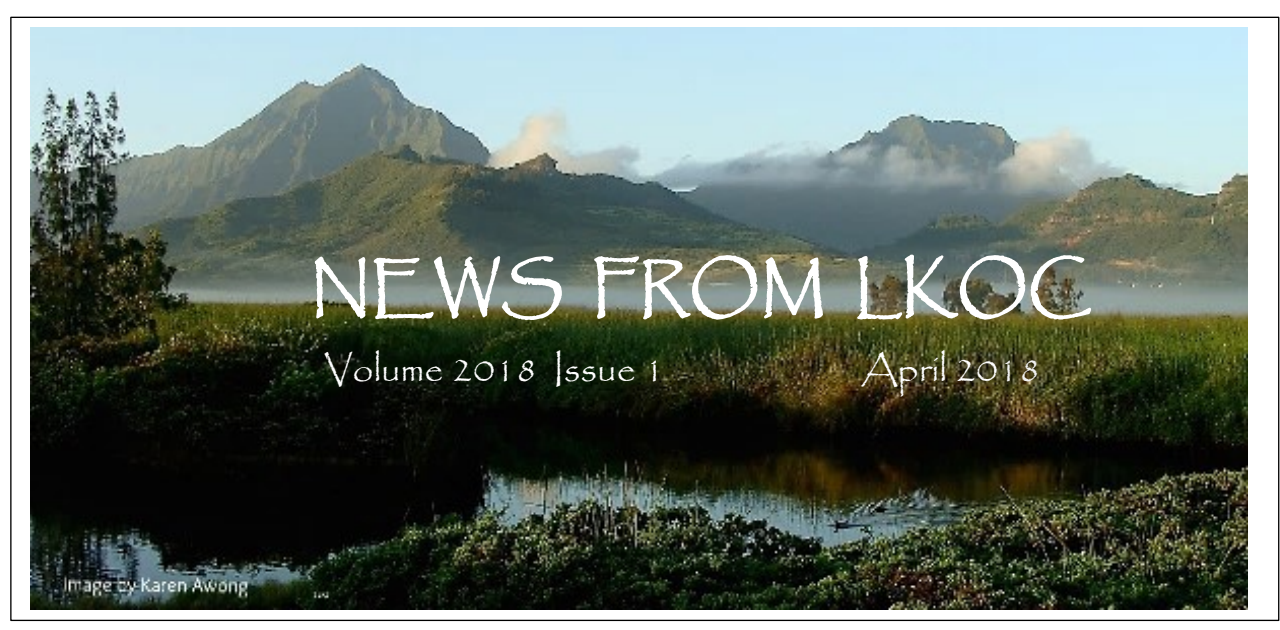
Aloha LKOC Members and Supporters,

This has been a challenging year for The Outdoor Circle, particularly with the passage of several county bills on both Maui and Oahu regarding the potential for outdoor advertising in our public parks and other public venues. We feel these new county ordinances have the potential to threaten our many hard fought victories over the past century. These successes have given Hawai'i one of the most exemplary set of outdoor signage laws in the country. Rules for implementation of these ordinances are still being formulated, and we will be monitoring them closely to ensure they adhere to our existing state and county sign laws.