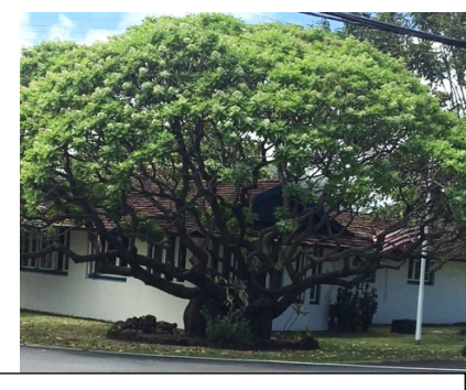
Heliotrope tree – salt tolerant

If there is a tree you appreciate, please help us let the owners know. We will write the owners a letter letting them know someone