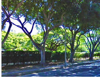
. . . And today

experts, and engaged community members who care deeply about maintaining the beauty of our island state. We maintain a small, dedicated central office staff headed by an Executive Director, all of whom have extensive backgrounds in environmental sciences and non-profit operations.