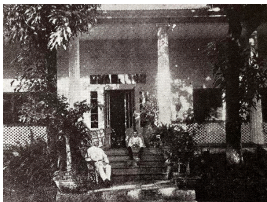
Queen Emma Summer Palace After Restoration, 1913