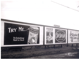
Started Campaign to Ban Billboards, 1912: Spearheaded enactment of Hawai'i's first signage laws, 1927 & state sign laws, 1957