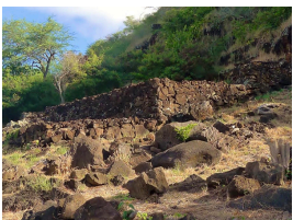
Pahua Heiau Restoration, 1984

The Outdoor Circle's history over the last 112 years is filled with well-recognized significant achievements, such as our 1912 campaign to eliminate billboards from the Territory of Hawai'i, and subsequently from the State. Hawai'i's billboard-free environment is now the envy of the nation. Our tree planting and tree preservation projects started in urban Honolulu in 1912 and have spread throughout communities across the islands, with over one million trees planted to date .