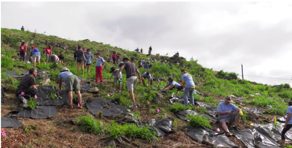
Dozens of volunteers met Saturday to plant 1,000 trees. (UH Manoa)

By HNN Staff | November 18, 2018 at 2:17 PM HST - Updated November 18 at 2:22 PM