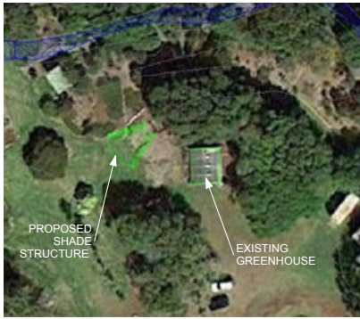
2 ENLARGED SITE PLAN NOT TO SCALE

66-1246 Mamalahoa Highway Kamuela, HI 96743 TMK: 66003007