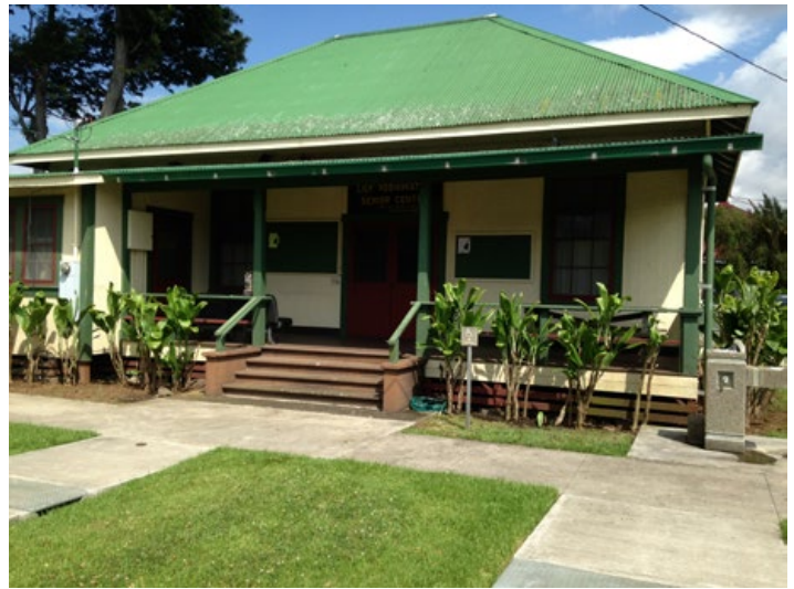
WOC volunteers concluded the recent Town Clean Up with a second Saturday morning spent tackling the Waimea Preservation Association and Senior Center buildings at the center of town. Two heaping truckloads of landscape debris and trash were hauled away!! See before and after pictures.