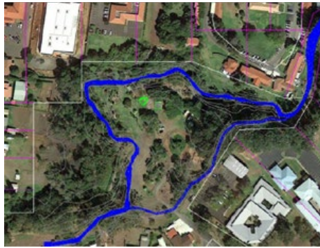
1 OVERALL SITE PLAN NOT TO SCALE