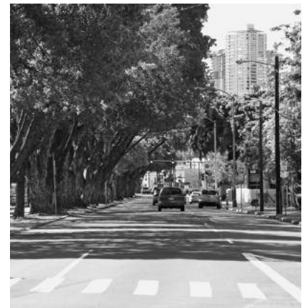
Careful pruning is required on protected Kalakaua Avenue Mahogany Trees.

The Greenleaf is published four times a year by The Outdoor Circle, 1314 South King Street, Suite 306, Honolulu, HI 96814. PH: (808) 593-0300 FX: (808) 593-0525 Email: mail@outdoorcircle.org Website: www.outdoorcircle.org