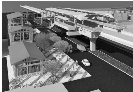
An aerial perspective of the proposed Waipahu Transit Center.