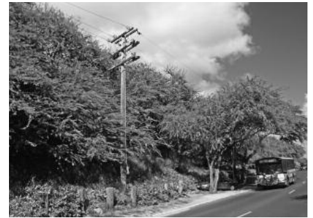
Power lines and Kiawe trees on Diamond Head Road.

Ultimately, the redefined relationship has resulted in less aggressive limb pruning in many areas and at the same time HECO says it is pleased with the level of protection it has been able to provide to its infrastructure. That literally means more reliable power to the people and a more beautiful island for everyone.