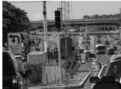
Farrington Hwy in Waipahu now being stripped bare for Transit.

The City says mitigation for the loss of trees will come later when transit stations are built. It claims that landscaping near the stations will compensate for the loss of trees on Farrington Highway. TOC contends that the City’s failure to provide mitigation violates the Federal environmental impact laws that require compensation for lost resources. To date, the City’s response has