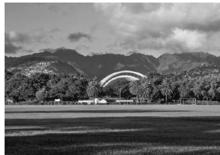
Trees and power lines are in conflict throughout Kapiolani Park.

protection can come into conflict. Overgrown tree branches can damage equipment and knock out power to homes and businesses. But cutting tree branches too severely can make beautiful trees ugly and may even compromise the trees' health.