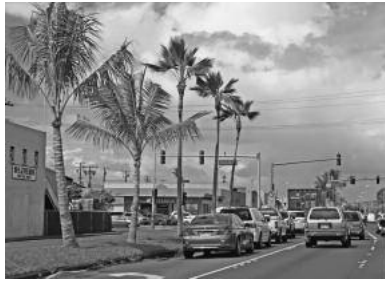
Trees removed from Farrington Hwy in Waipahu are now in the median of Nimitz Hwy.

Despite the fact that the project has not received final approval or funding from the Federal government, the first phase of the Honolulu Transit project is moving ahead full-speed. Dozens of trees already have been removed for pre-construction work. Most of the trees have come from the median of Farrington Highway. Many of them have been transplanted at State Department of Transportation interchanges and highways—especially Nimitz Highway where dozens of Palms have been relocated.