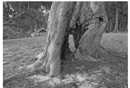
The result of dumping hot charcoal

The trees were removed from Waimanalo Beach Park and Waimanalo Bay Park, known to most residents as Sherwood Forest. Concern for the condition of trees in these parks was first