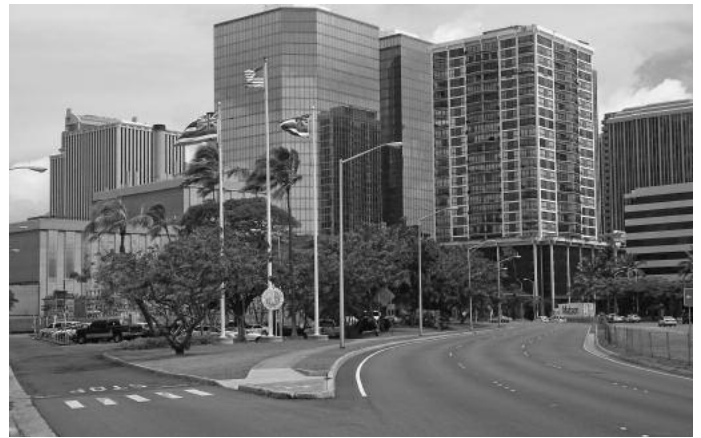
The DEIS states that the transit project's most serious impacts will be felt from downtown area to Ala Moana Center